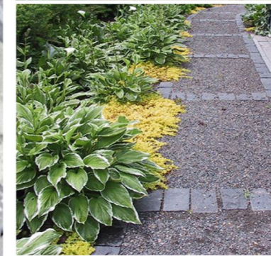
Varied surface textures to create sensory heirarchy.