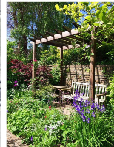
Reflective spaces. Small scale gathering with sensory planting