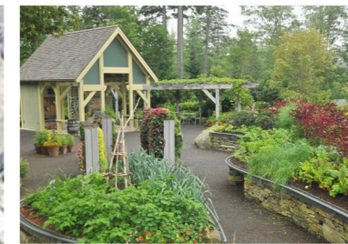
Therapy / Sensory Garden