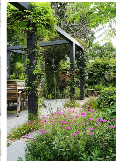
Pergola and scaled social gathering spaces.