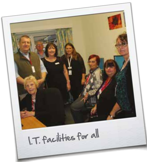
I.T. facilities for all