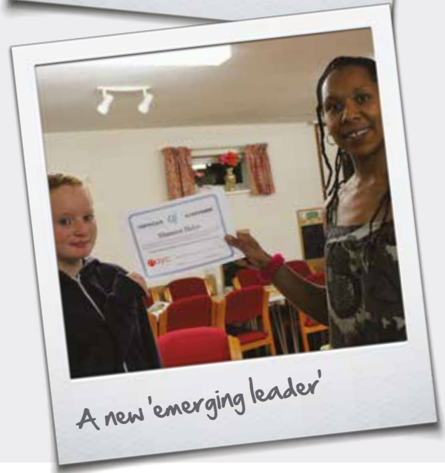
A new 'emerging leader'