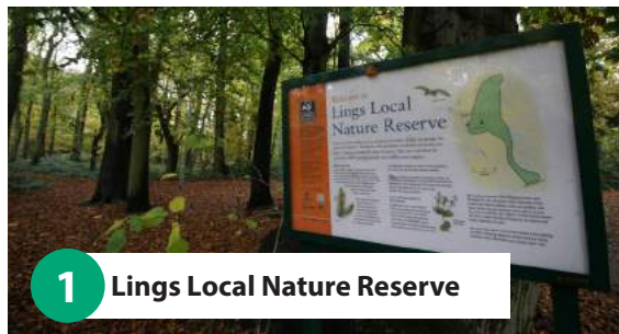
1 Lings Local Nature Reserve