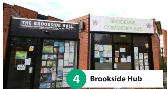
4 Brookside Hub

Library: Weston Favell Library, Weston Favell Centre