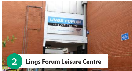
2 Lings Forum Leisure Centre