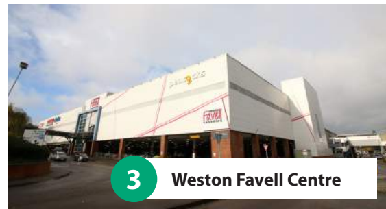
3 Weston Favell Centre