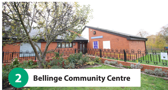
2 Bellinge Community Centre