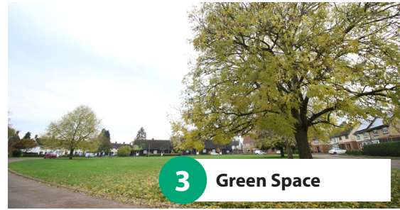
3 Green Space