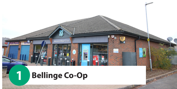
1 Bellinge Co-Op