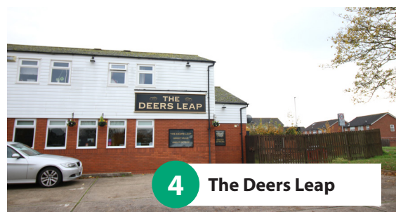
4 The Deers Leap